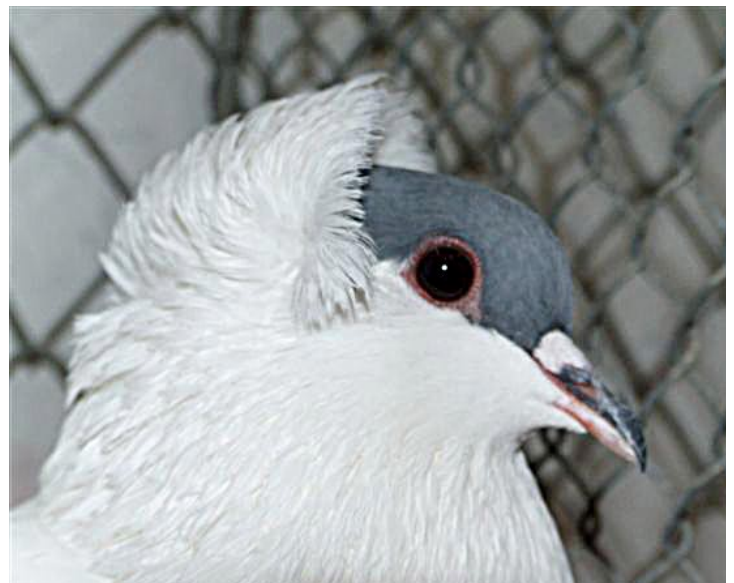
Blue Fullhead owned by Ben Kocken.

That's all for now. Take care, enjoy the remainder of the season!