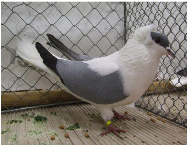
Ben Kocken's Best Blue Barless Hen rated HV 96