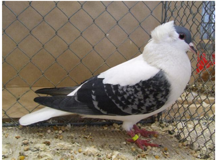
Best Blue Check Thuringer at a recent show in Europe.